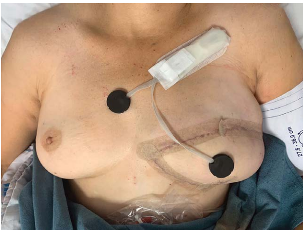
Fig. 1. FFP applied to unilateral DIEP flap, directly postoperative. Main module is placed caudal of the clavicle, and sensors are adhered to the DIEP flap and sternum (reference location).

The FFP was removed once the patient was discharged from the hospital, when a take-back occurred, or if the patient requested removal of the device. After removal of the patch, the skin was assessed for irritation, and patients were asked semistructured questions about their experience with the Free Flap Patch.