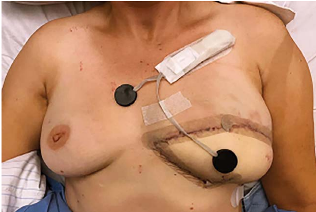
Fig. 2. DIEP flap with FFP applied; before revision surgery.

against the uneventful DIEPs, a downward trend outside the SD is visible (Fig. 4).