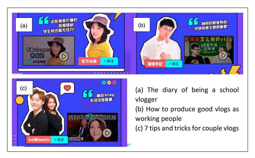
Figure 1. Three demonstrated cases in the No. 8 campaign, screenshot, May 2021. (a) The diary of being a school vlogger (b) How to produce good vlogs as working people (c) 7 tips and tricks for couple vlogs.

(who do not have a large follower base) additional visibility in addition to the algorithmic recommendation. Both ways urge users to try vlogging and compete for financial or cultural rewards.