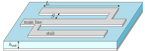
Fig. 1: Double-folded microstrip band-stop filter geometry.

In this application example, the proposed GPR framework is evaluated for modeling the transmission of a double-folded microstrip band-stop filter, formed by a dielectric substrate between a top metallization and a bottom ground plane. As illustrated in Fig. 1, the geometry of the upper layer consists of two stubs, with identical length and spacing, folded onto the two sides of a transmission line. The S-parameters of the device are simulated for a set of 15 equispaced frequencies within the [5, 25] GHz range using ADS Momentum. The chosen design parameters are the stub length L \in [1.5, 3.0] \mu m and line-stub spacing S \in [0.0, 0.3] \mu m .